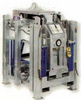
COMPACT AND TRANSPORTABLE